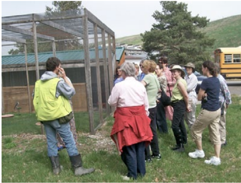
Go-See Tour at High Acres Landfill: The group at the Falconry where a landfill employee explains the use of falcons to drive away sea gulls.