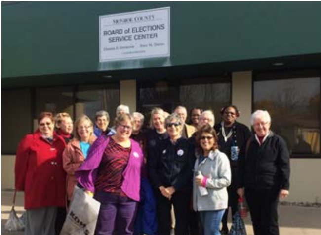
Absentee Ballot counters

Your help was very much appreciated, especially since helping the Monroe County Board of Elections was a fundraiser for the LWV-RMA.