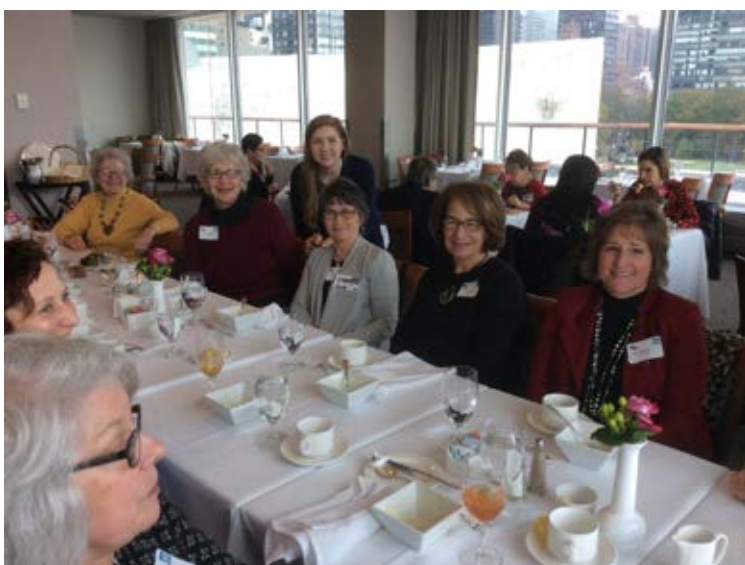
Some of the LWV members gathering for luncheon at the UN.