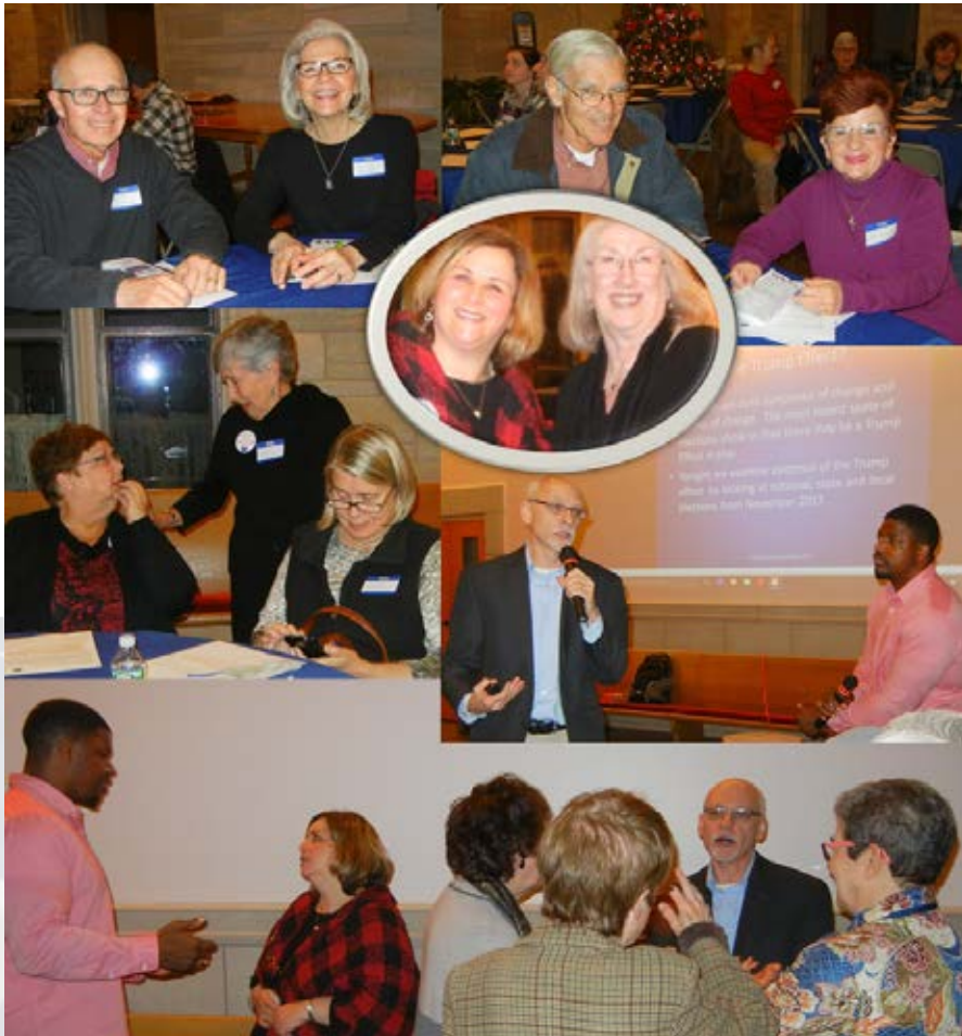
Seen at the December 5 forum -