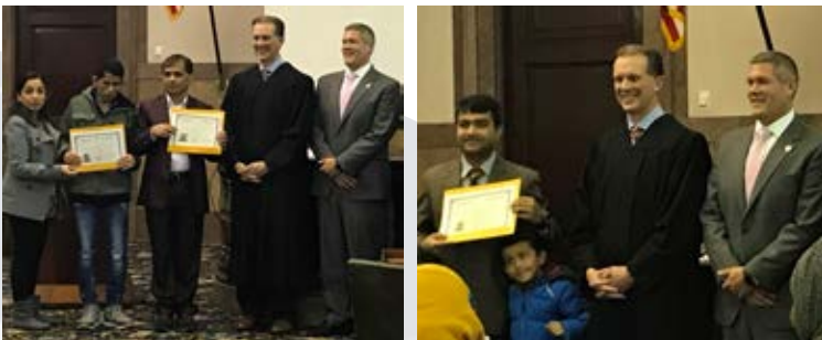
Seen during naturalization ceremonies at the Monroe County Office Building on November 29 are new citizens with NYS Supreme Court Justice William Taylor and Monroe County Clerk Adam Bello.