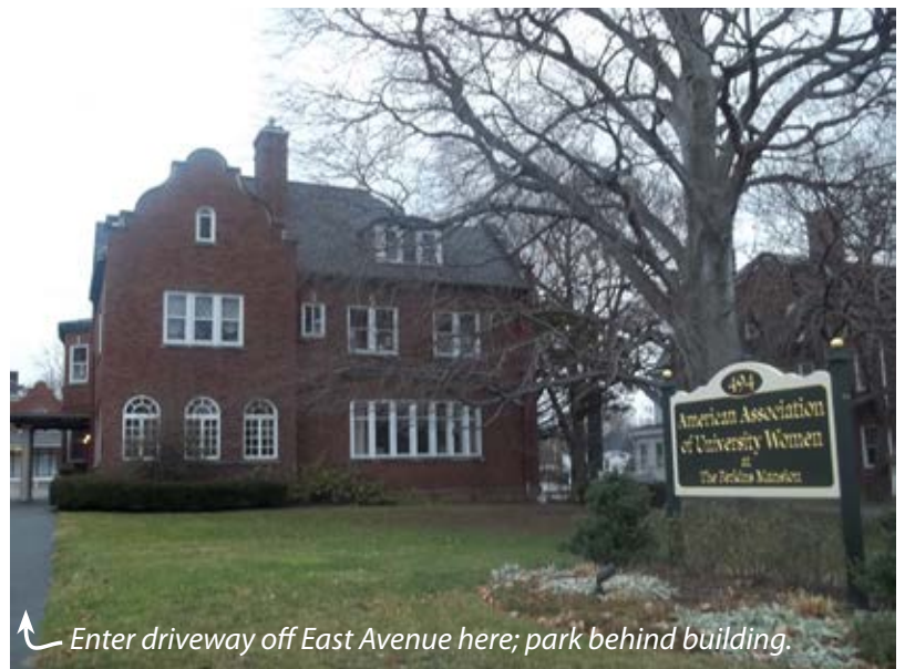
Enter driveway off East Avenue here; park behind building.

We look forward to seeing you and hearing your input!