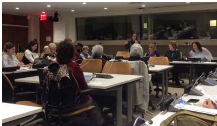
LWV members meeting in UN Briefing Room.