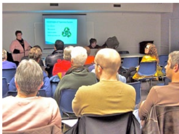
Audience, Increasing Voter Participation Forum