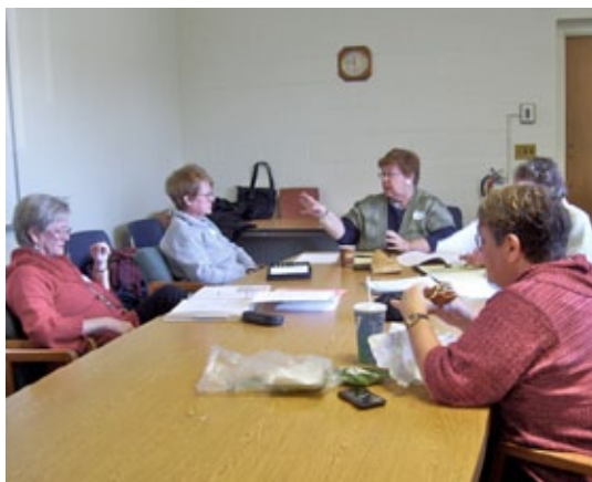
Program Planning Meeting

Board meets at 2:00 pm on the third Thursday of each month.