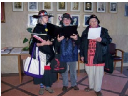
Cameo appearance by the fabulous Raging Grannies.