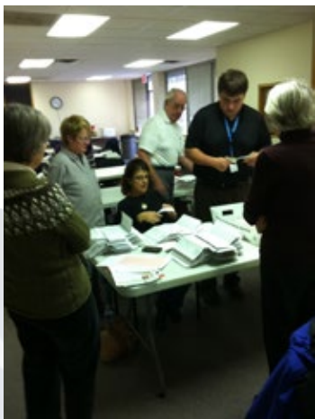
League members assisting with absentee ballot count on Election Day