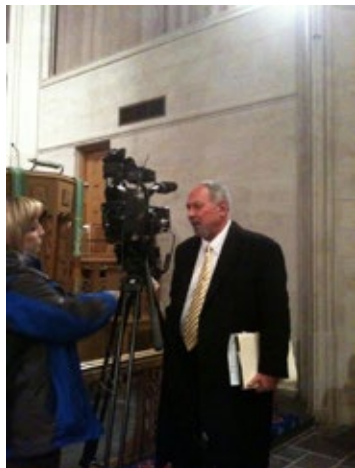
Forum on Casino Ballot Amendment