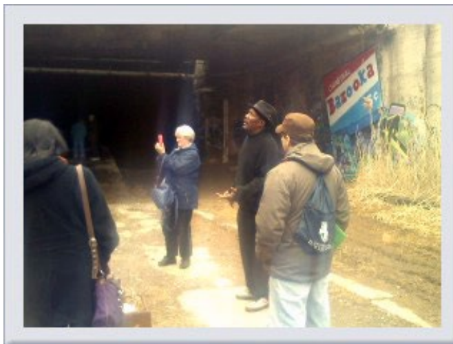
In the old subway