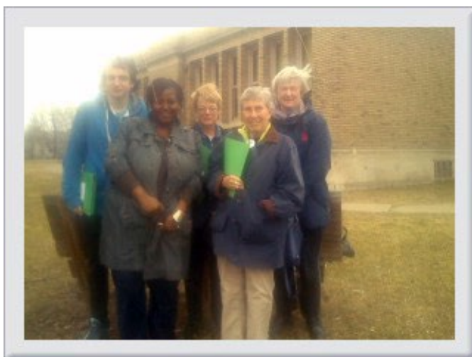
Our League on the tour