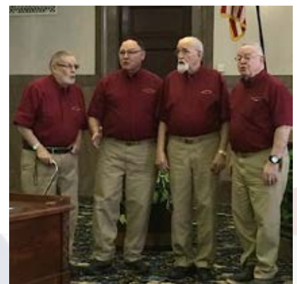
Webster Grange #436 Quartet welcomes the new citizens with song!