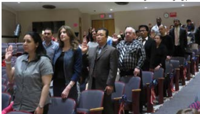
taking the oath of citizenship