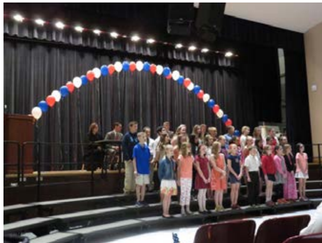
fifth graders singing patriotic US songs