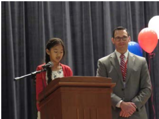
fifth grader addressing the new citizens