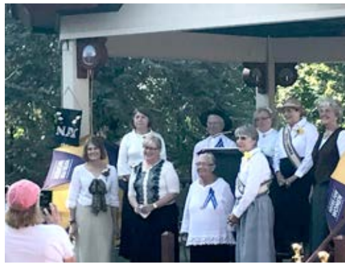
Fairport VoteTilla ceremony at canal side.