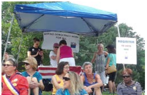
Celebrants in front of LWV-RMA voter registration booth waiting at Corn Hill for the VoteTilla barge.