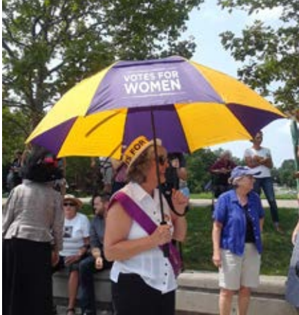
Celebrant at Corn Hill Landing to greet VoteTilla.

Among the barge's stops were Faiport and Rochester's Corn Hill Landing where LWV-RMA members joined the festivities.