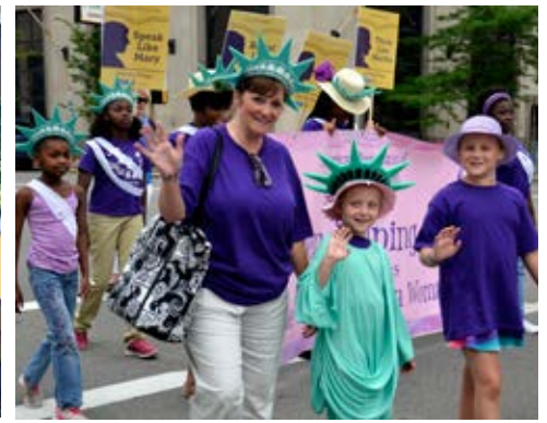
Women's Rights Parade Lady Liberty contingent.