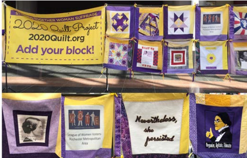
Note our quilt square made by Elaine Schmidt second from the left.

Pictured (below) are some of the participants as well as some of the quilt squares created to commemorate 100 years of voting rights for women.