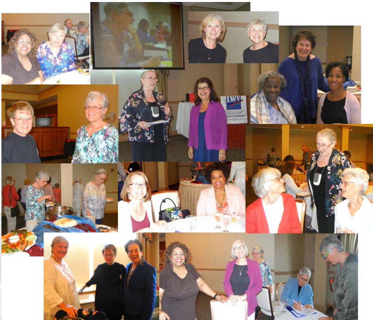
Shown here are members socializing before and after the annual business meeting.