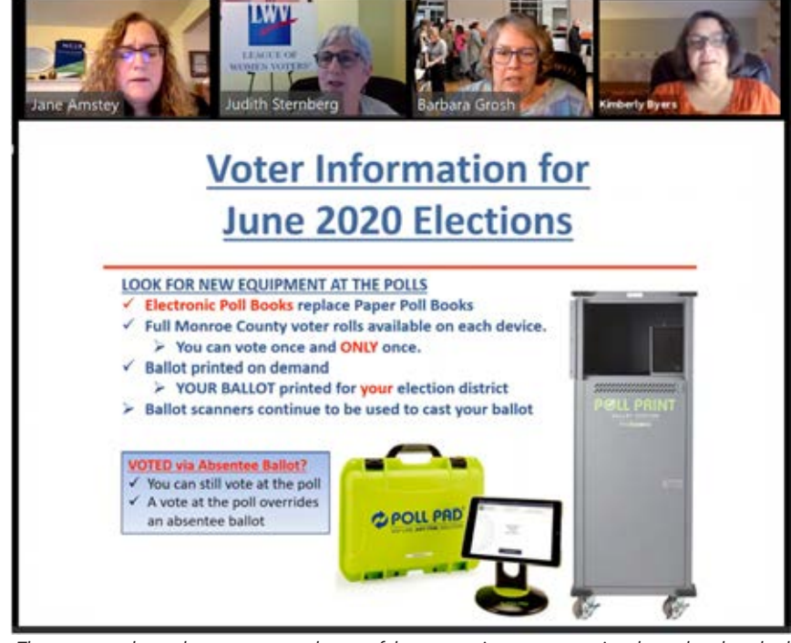
The montage shows the presenters and some of the new equipment supporting the updated methods of voting.