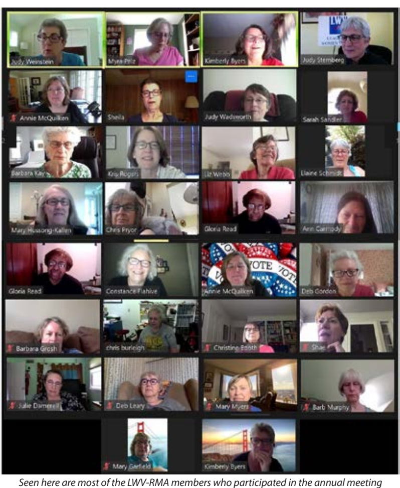
Seen here are most of the LWV-RMA members who participated in the annual meeting on June 4. A few joined using their phones and were not visible to others.