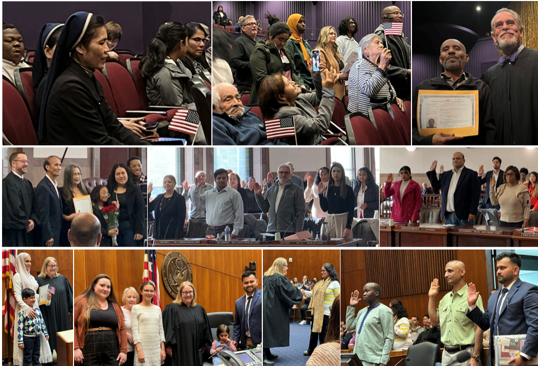
Top Row November 12; Middle Row November 19 A.M. Bottom Row November 19 P.M.