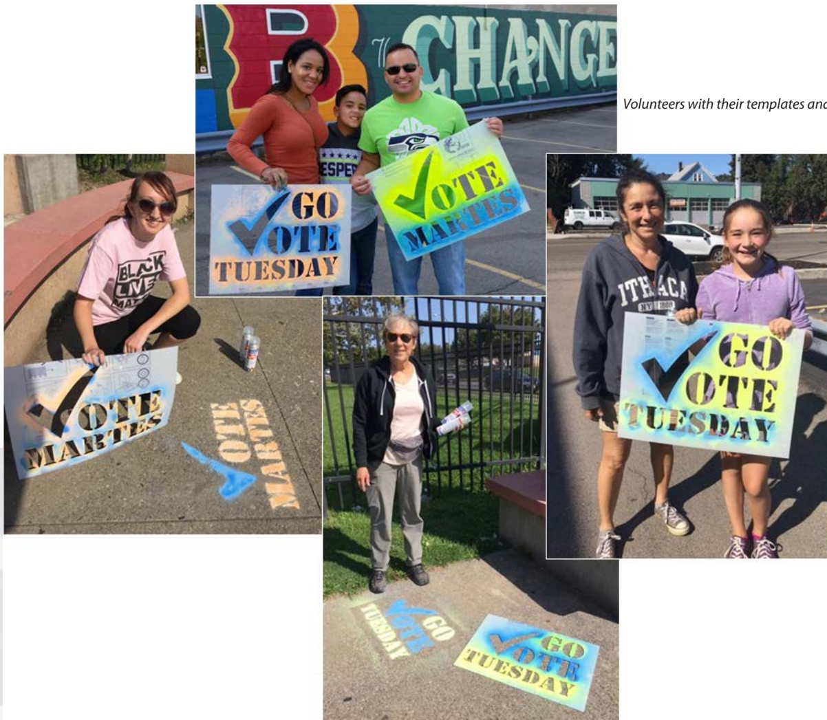
Volunteers with their templates and chalk.