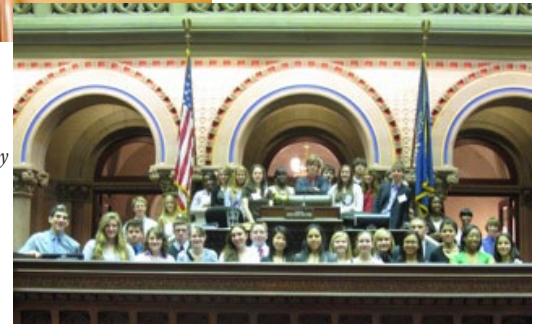
Students inside Albany