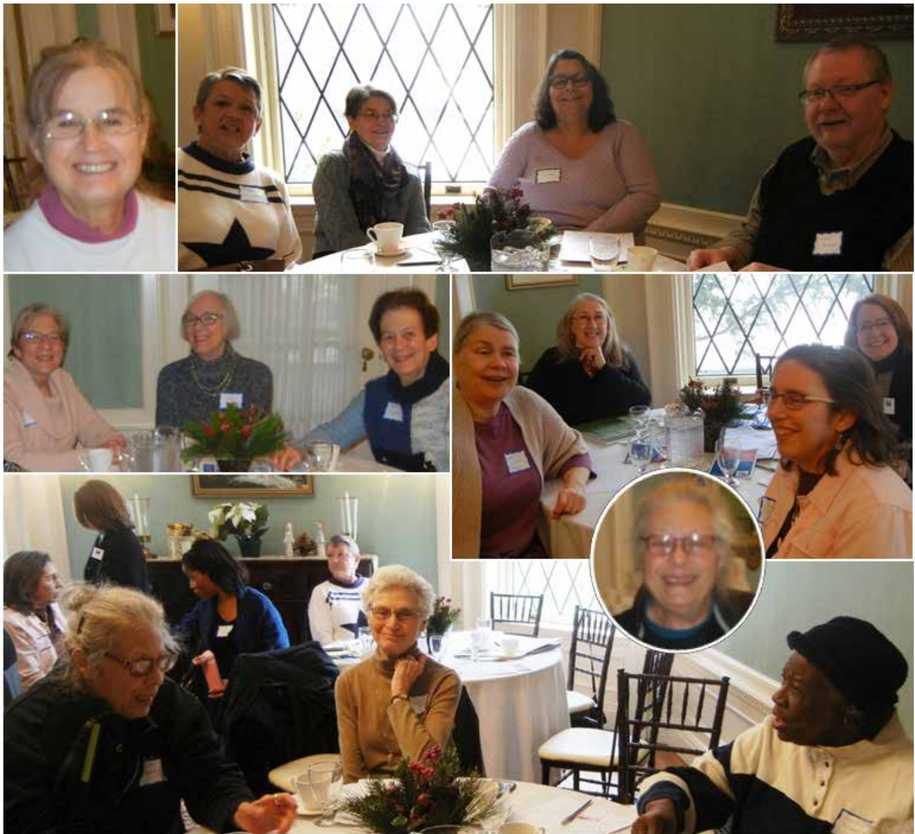
Members interacting during the annual planning meeting.

While the purpose of the meeting was to discuss important issues, we had the opportunity for informal discussions and to get to know one another better.